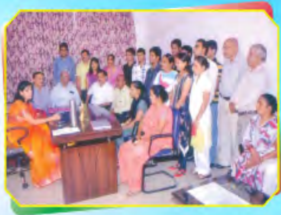
Parent-Teacher Meets are high on our agenda