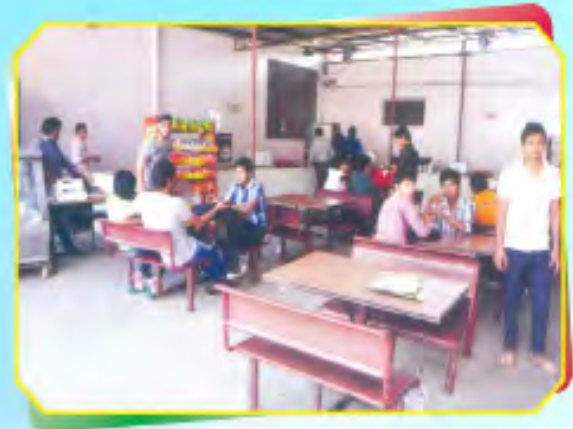
Cafeteria time is carefree time.