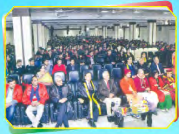
The sprawling College Auditorium is ever abuzz with activity