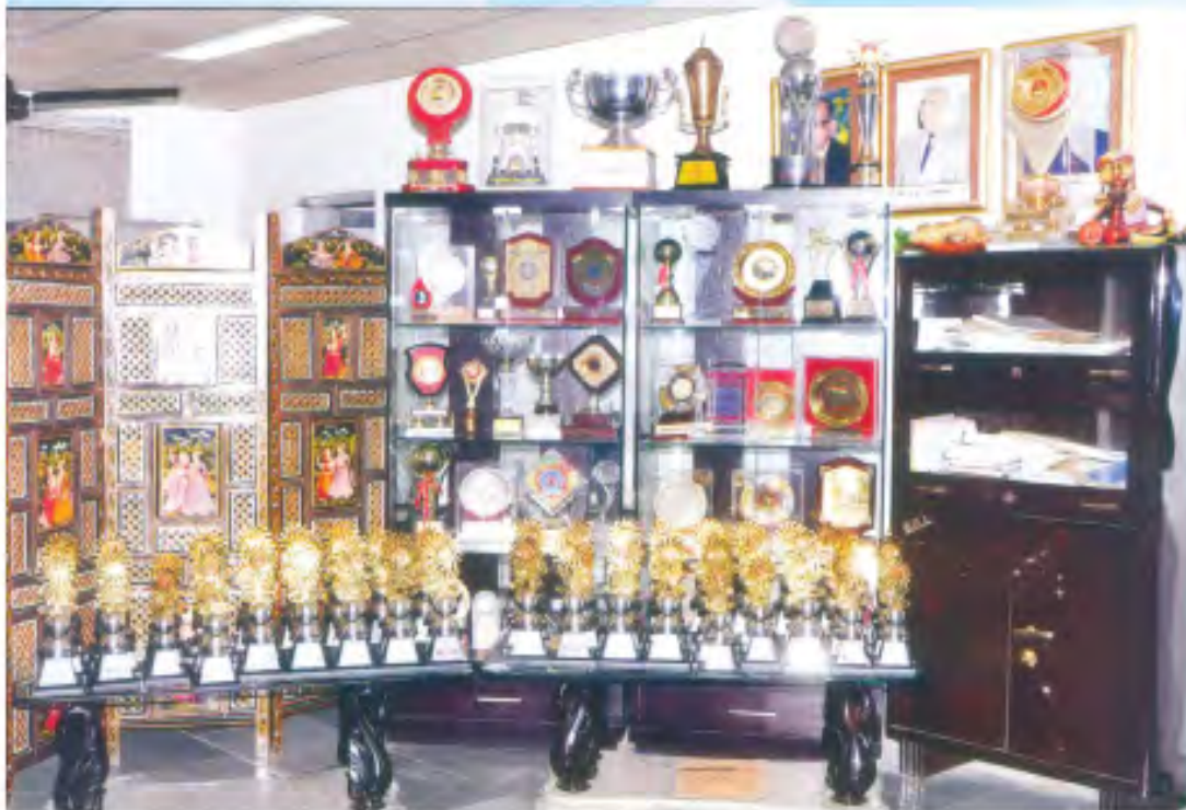
The rich collection to trophies speaks volumes for our excellent track record of all-round achievements.