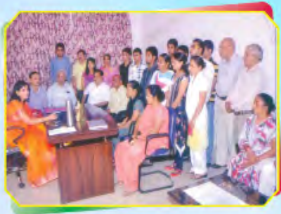
Our scholars absorbed in books in the spacious Reading Room of the Main Library